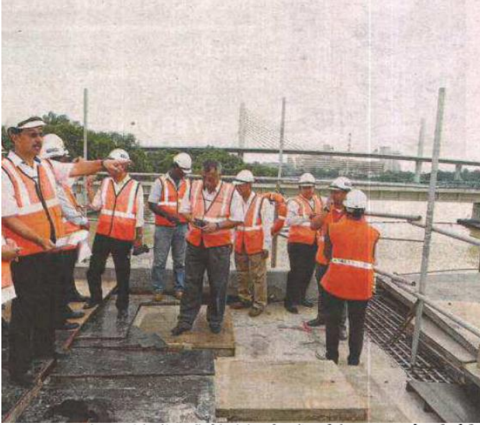
Tan Sri Syed Hamid Albar (left) visits the site of the new swing bridge, which will allow boats in Sungai Prai to pass by more quickly as it only takes five minutes to lift, compared with the 20 minutes required by the old bridge.